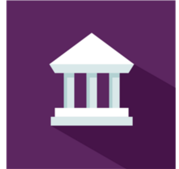
Advocacy in DC

World's largest professional society of active accredited angel investors - www.angelcapitalassociation.org