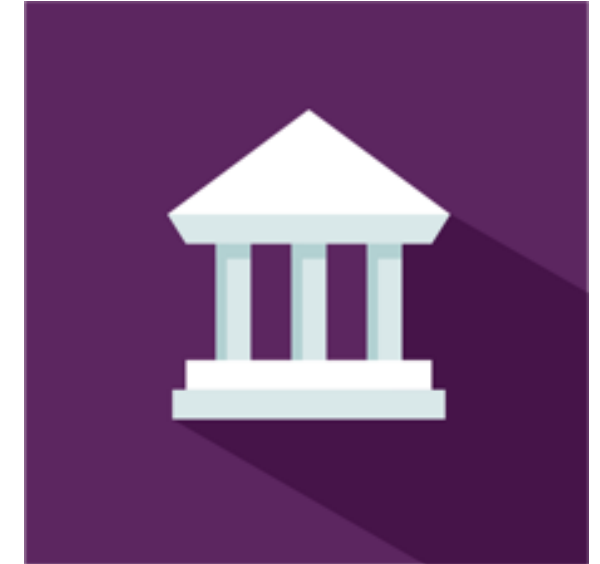
Advocacy in DC

World's largest professional society of active accredited angel investors - www.angelcapitalassociation.org