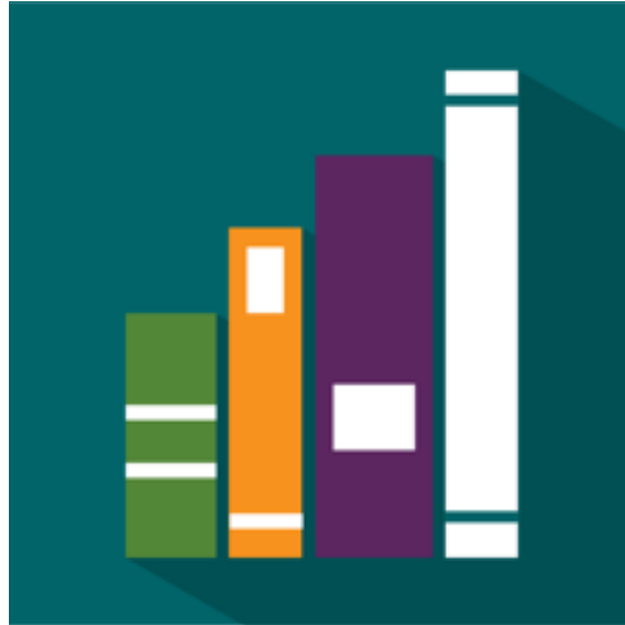
Gold Standard Education